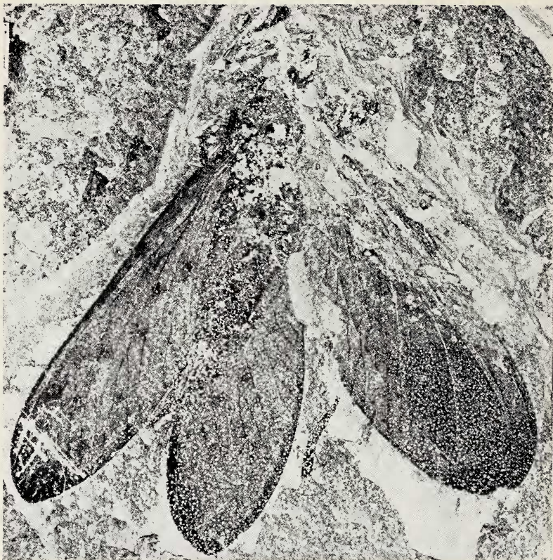
Photograph of Diaphanoptera superba Meunier, type specimen (original, \times 6 ), in Laboratoire de Paleontologie, Paris. The fine white spots visible on wings and body are mineral in nature and also occur on much of the rock surface.